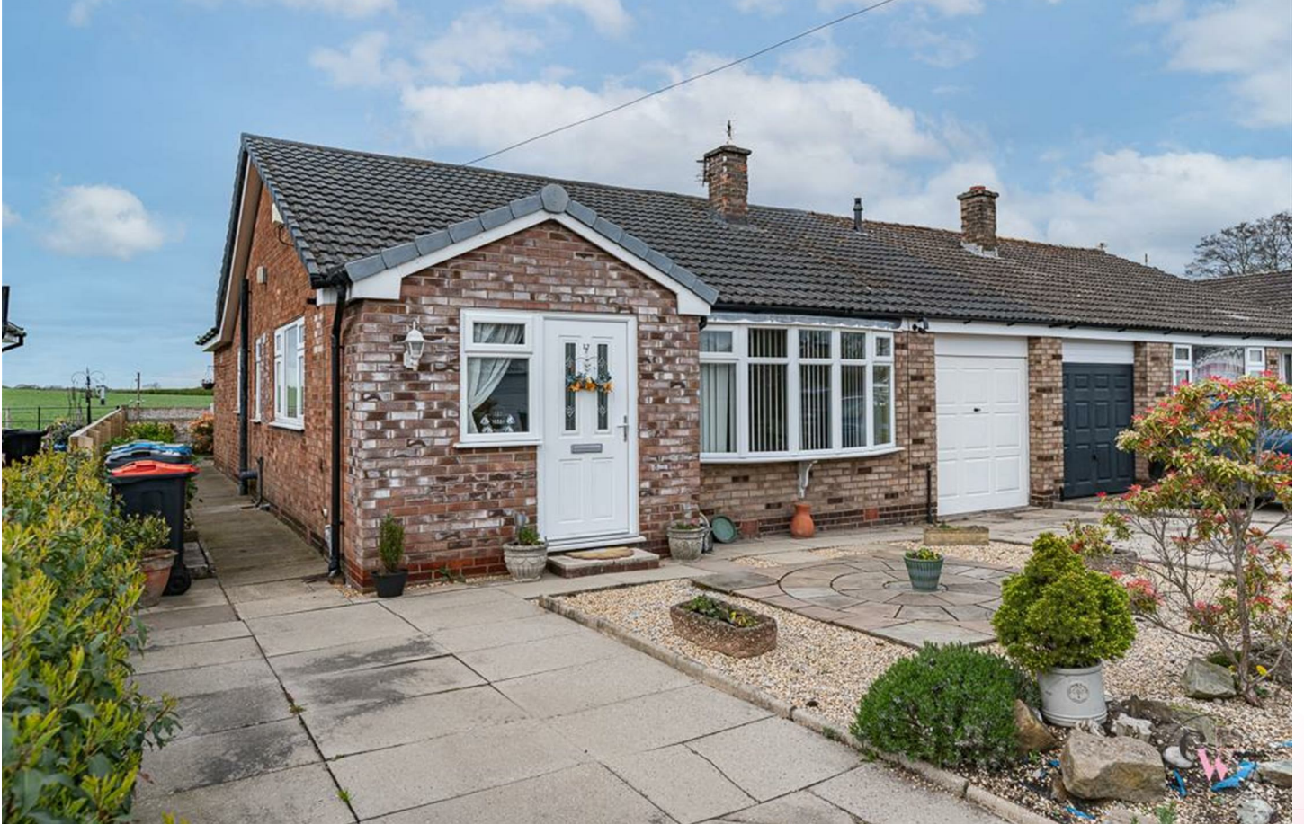
Eaton View, Northwich CW9 8PJ